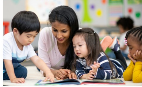
9.30am - 11.30am

At: Bloomsbury Nursery School, Bloomsbury Street, B7 5BX